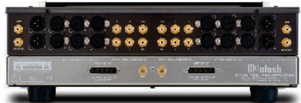
Top: Controller Bottom: Tube Preamplifier